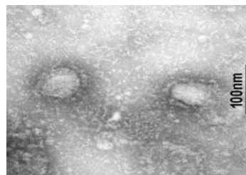
* 2003 Sars Coronavirus, Em

In 2003, following the outbreak of severe acute respiratory syndrome (SARS) in Asia, with secondary cases elsewhere in the world, the World Health Organization (WHO) issued a press release stating that a novel coronavirus identified by a number of laboratories was the causative agent for SARS. The virus was officially named the SARS coronavirus (SARS-CoV). Over 8,000 people were infected, and about 10% died.